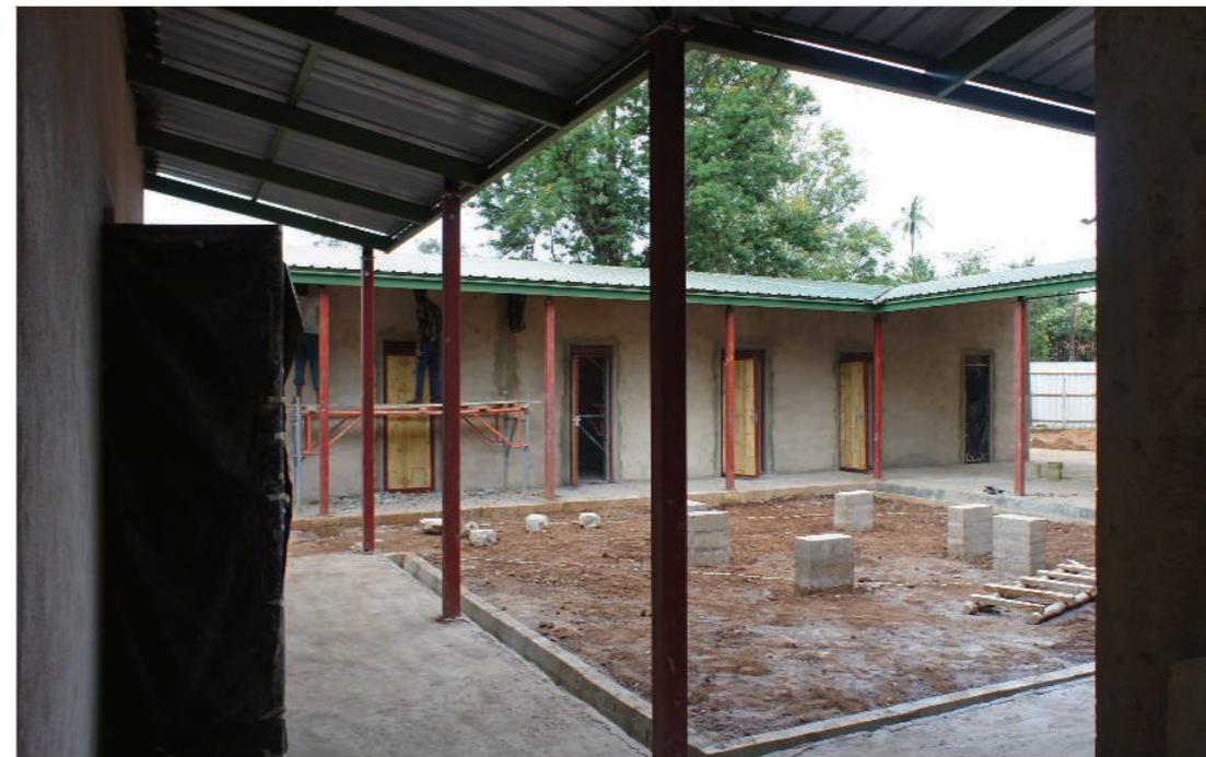
Construction site in March, 2015.