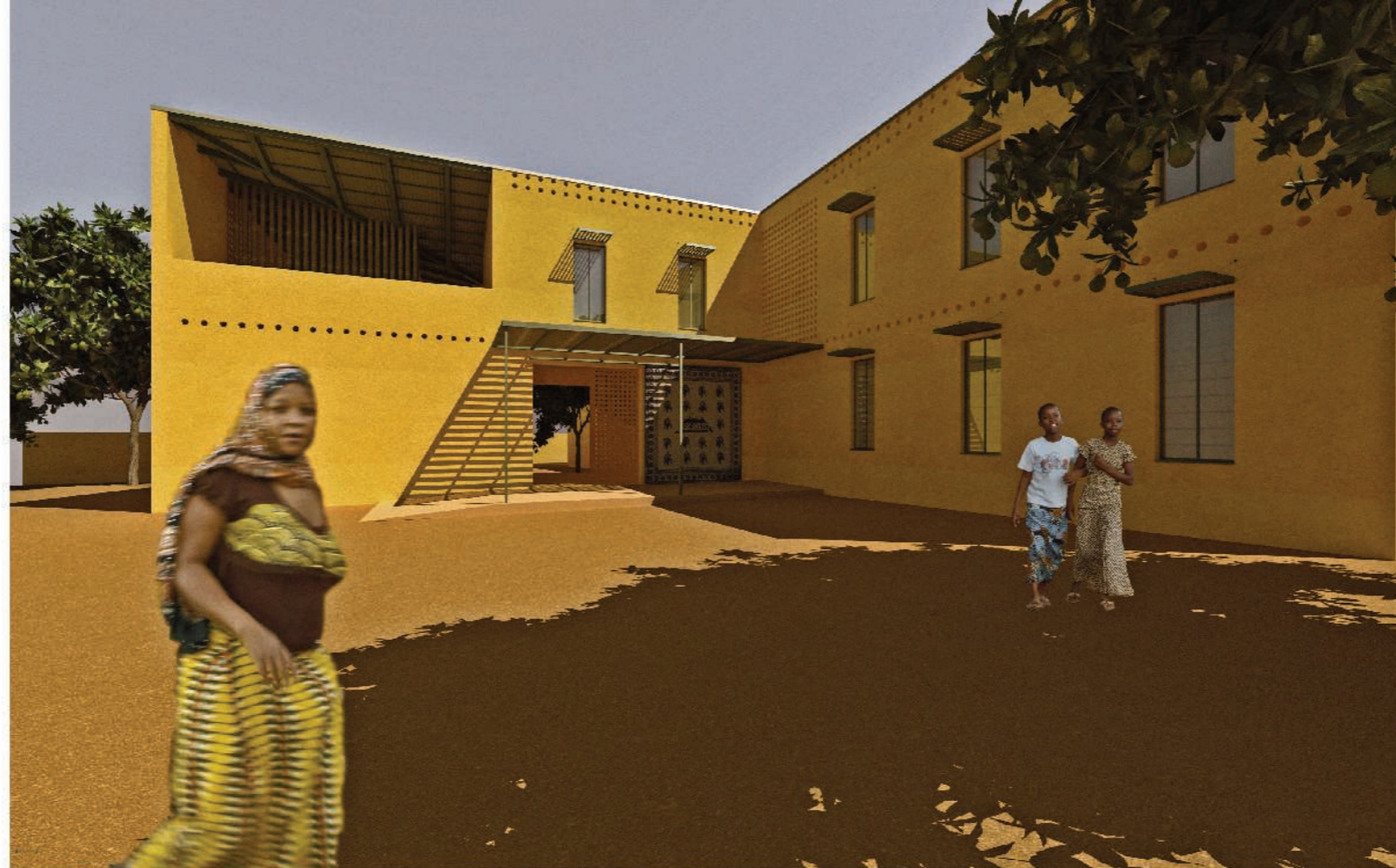
Rendering of the main entrance.